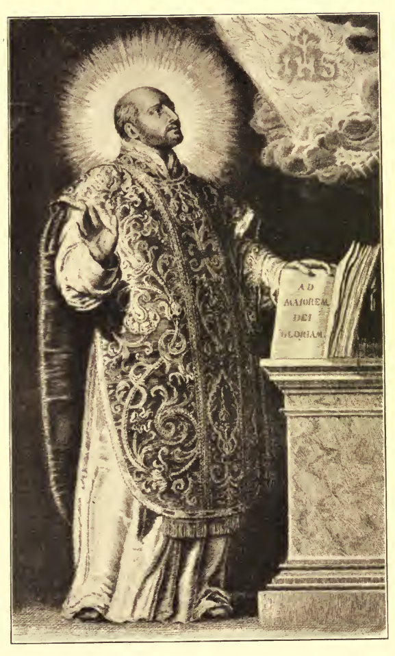
St. Ignatius at the Holy Sacrifice. Painted by Rubens.