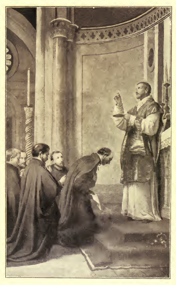
THE FIRST VOWS AT MONTMARTRE OF ST. IGNATIUS AND COMPANIONS. FATHER FABER CELEBRATING MASS.