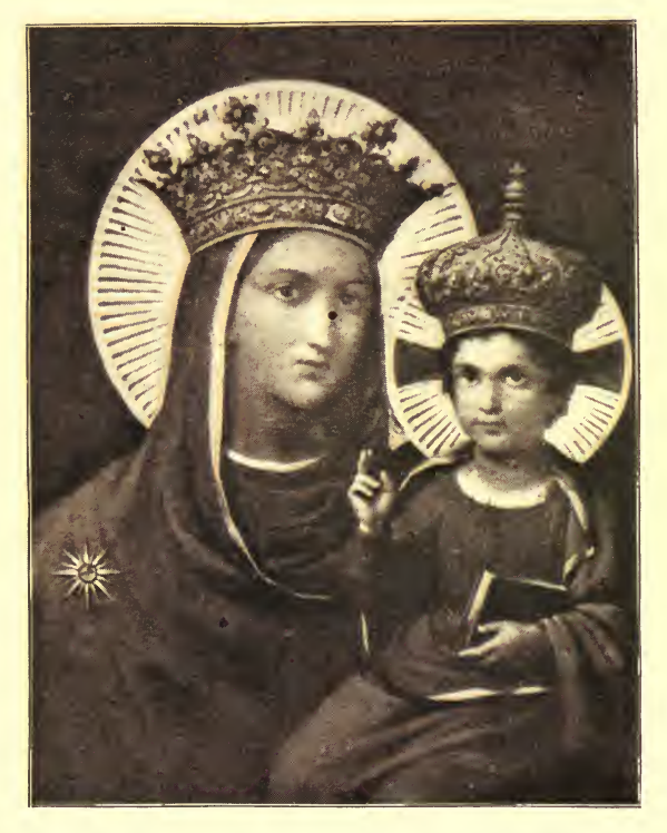
OUR LADY OF THE WAYSIDE. Favorite Picture of St. Ignatius.