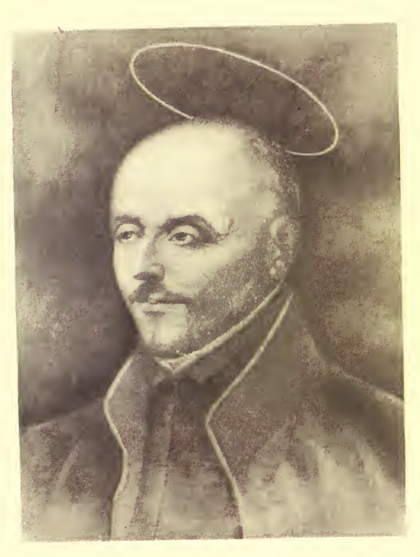
St. Ignatius Loyola.